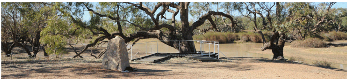
Fig 3: Dig Tree, Burke and Wills Expedition Sites

The extraordinary story of the ill-fated Burke and Wills expedition – and the crucial role of the Yandruwandha Aboriginal people who tried to help them – has been