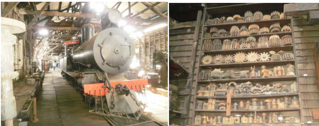
Fig 1: locomotive; Fig 2: shelf of wooden patterns

On the night of Thursday 7 January 2016 a ferocious bushfire all but destroyed the town of Yarloop some 130 kilometers south of Perth. Two elderly residents died and 128 houses were destroyed, as were the heritage listed Yarloop workshops and steam museum.