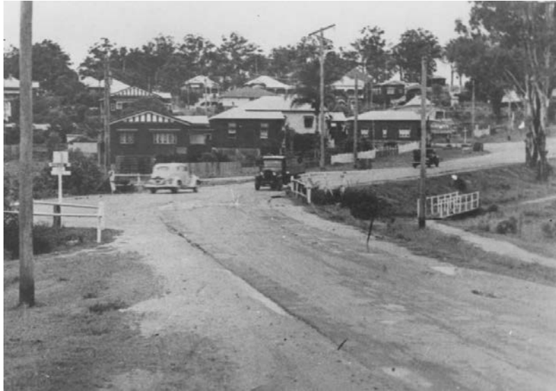
Fig 7: Vehicles on the road at Annerley, ca. 1935

A history conference is being held on Saturday 27 February 2016 at the Marymac Community Centre 616 Ipswich Road, Annerley (adjacent to Our Lady's College)